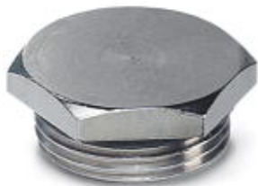
Filler plug, metal, size: M40

Please be informed that the data shown in this PDF Document is generated from our Online Catalog. Please find the complete data in the user's documentation. Our General Terms of Use for Downloads are valid ( http://phoenixcontact.com/download )